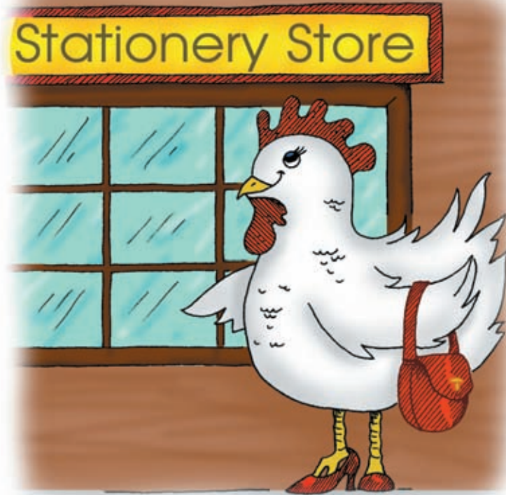
the red hen