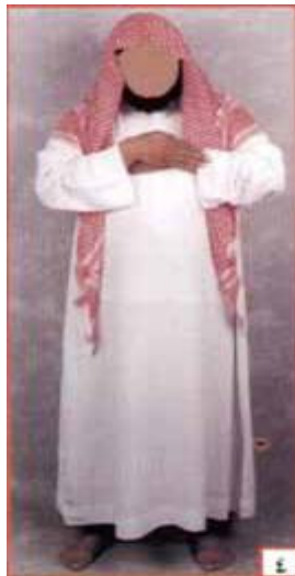
Hands on the Chest; Right Hand over the Left

3. Place the right hand over the left on the chest. Look at the place of prostration without lowering your head.