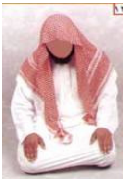
The left and right foot in IFTIRASH