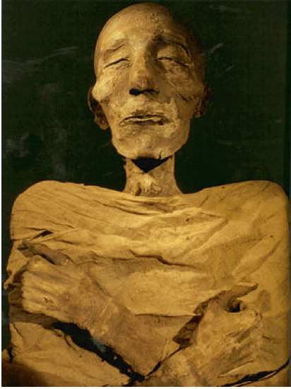
Fig. 12: Mummy of Merneptah (ca.1212 -1202 BCE), Exodus Pharaoh

Moses' Pharaoh's and Mummification [39] (Archaeological and Islamic Sources): Among the many hypotheses, concerning the historical time-frame occupied by the Exodus in the history of the pharaohs, I have concluded that the most likely is the theory which makes Merneptah [40], Ramesses II's [41] successor, the pharaoh of the Exodus. The comparison of the data contained in the Scriptures with archeological evidence strongly supports this hypothesis. I am pleased to be able to say that the Biblical narration contributes weighty evidence leading us to place Moses in the history of the pharaohs. Moses was probably born during the reign of Ramesses II. (Fig. 11) Biblical data are therefore of considerable historical value in the story of Moses. A medical study of the mummy of Merneptah (Fig. 12) has yielded further useful information on the possible causes of this pharaoh's death [42, 43]. The fact that we possess the mummy of this pharaoh is one of paramount importance. The Bible records that pharaoh was engulfed in the sea, but does not give any details as to what subsequently became of his corpse. The Qur'an, in Surah Yunus notes that the body of the pharaoh would be saved from the waters: "Today I will save your dead body so that you may be a sign for those who come after you" [44].