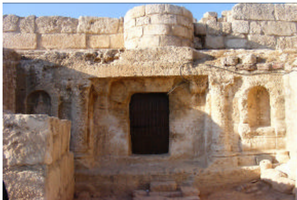
Fig. 9: View of entrance Ashab Al Kahf in Amman, Jordan

The Story of Adam and Hawwa (Eve): Adam and Hawwa' (Eve) lived together in Paradise for a period of time. Allah permitted them to eat from all the fruits of Paradise, except the fruits of one particular tree. Allah allowed them to go from one place to another in the apparent locations of Paradise to eat from the fruits and to benefit from these locations. Adam and Hawwa' (Eve) were not given permission to eat from that tree (the name of the tree is not mentioned) but Iblis was able to whisper to them to eat from it. As the story goes, Hawwa' (Eve) eventually was driven to eat from it and as such started encouraging Adam to eat from it as well. Doing so, they committed a sin Allah warned them from doing, so they became sinful, however it was a small sin and they both quickly repented to Allah as stated in the Qur'an [37].