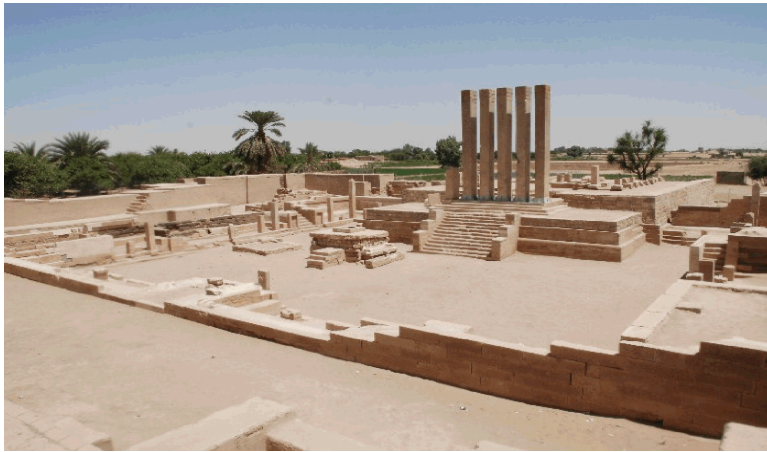
Fig. 4: Saba: Remains of Temple Aum (Mahram Balqes)