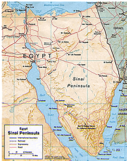
Fig. 5: Map of the Sinai Peninsula with country borders

Gaza: Gaza's history of habitation dates back 5,000 years ago, making it one of the oldest cities in the world [18]. Located on the Mediterranean coastal route between North Africa and the Levant, for most of its history it served as a key entrepôt of the southern Levant and an important stopover on the spice trade route traversing the Red Sea [19].