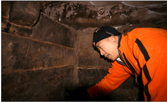
Fig. 13: Remains of Noah's Ark have been found, Researcher examines wooden beams inside 'Noah's Ark'

Noah left the Ark and he and his family and companions built a town at the foot of Mount Judi, named Thamanin ("eighty") in reference to their number. Noah then locked the Ark and entrusted the keys to Shem. Yaqut al-Hamawi (1179-1229 CE) mentions a mosque built by Noah which could be seen in his day. Some modern Muslims, although not generally active in searching for the Ark, believe that it still exists on the high slopes of the mountain.