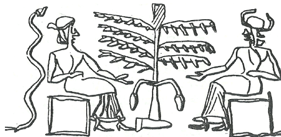
Fig. 10: Sumerian cylinder seal shows Adam and Hawwa and snake behind Hawwa

From archaeological point of view the story is depicted on one of the Sumerian cylinder seal that shown the serpent standing behind Eve and whispered her to eat- the tree in cylinder seal look like date palm tree- then she Hawwa' started encouraging Adam to eat from that tree. It seems to me that the story of Adam and Hawwa was transfer from one generation to another until reach to Sumerian in the third millennium BCE (Fig. 10).