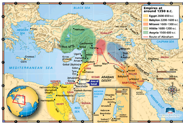
Fig. 1: Map shows the ancient Near East

archaeology. The Holy Book mentions various ancient places, Prophets, people and events that took place, although only a few of these have been uncovered by archaeology.