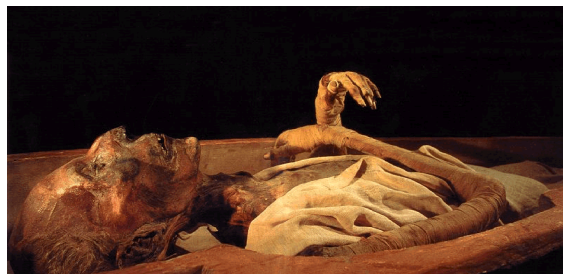
Fig. 11: The Mummy of Ramesses II (c. 1279- 1212 BC), Pharaoh of Moses, in the Egyptian Museum, Cairo