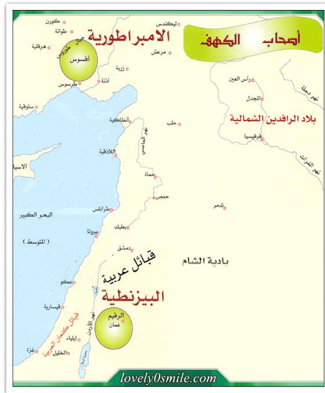
Fig. 7: Map shows the location of Ashab Al Kahf

The Archaeological Evidence: There are two views which referred to the location of Ashab Al- Kahf. Firstly, some allege that it is in Ephesus, Turkey. This is the common allege between the Muslim historian and interpreters whom a doubt the Christian story that the Ashab Al Kahf in Ephesus. On the slopes of Mount Pion (Mount Coelian) near Ephesus (near modern Selcuk in Turkey), the "grotto" of the Seven Sleepers with ruins of the church built over it was excavated in 1927-28. The excavation brought to light several hundred graves which were dated to the 5th and 6th centuries. Inscriptions dedicated to the Seven Sleepers were found on the walls of the church and in the graves. This "grotto" is still shown to tourists.