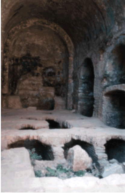
Fig. 8: View of Ashab Al Kahf in Ephesus Turkey