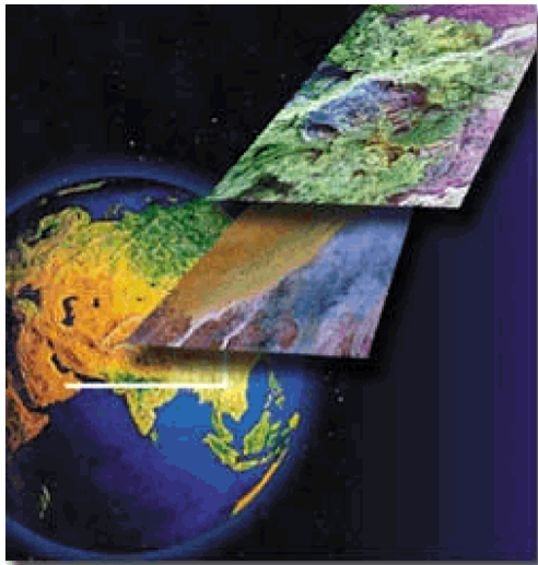
Fig. 3: The above satellite photographs show a section of Oman in the south of the Arabian Peninsula. In the photographs of the city of Ubar, viewed from space by NASA in 1992, were identified traces of ancient desert tracks. The people of 'Ad, revealed 1,400 years ago in the Qur'an, emerged as one of the miracles of the Qur'an through modern-day technology

Saba (City of Sheba) [10]: Saba is a city in Yemen which is mentioned in the Holy Qur'an as well, Allah says: "There was, for Saba, aforetime, a Sign in their homeland - two Gardens to the right and to the left" [11]. Saba was the period of the time of Prophet Solomon and Queen of Saba around the beginning of the first millennium BC and the story of Prophet Solomon and Queen of Saba was also mentioned in Holy Qur'an, Allah says "I have come to thee from Saba with tidings true, I found (there).