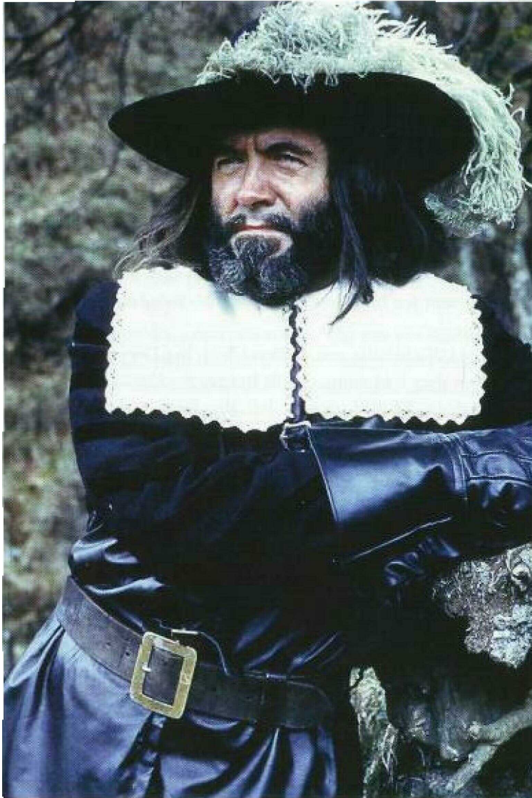
It was Carver Doone who spoke.

The next day, Jeremy led me outside the house. He told me that he had discovered more about the possible rebellion against the king's brother. He was now certain that many people in this part of the country hated James. Most of these people were young and not very wise, but some of the great lords in the area were leading them. The Doones and Lord Wichehalse were among the leaders. The government wanted Jeremy to discover more about their plans. Jeremy was also making plans for soldiers to move the Doones out of their valley.