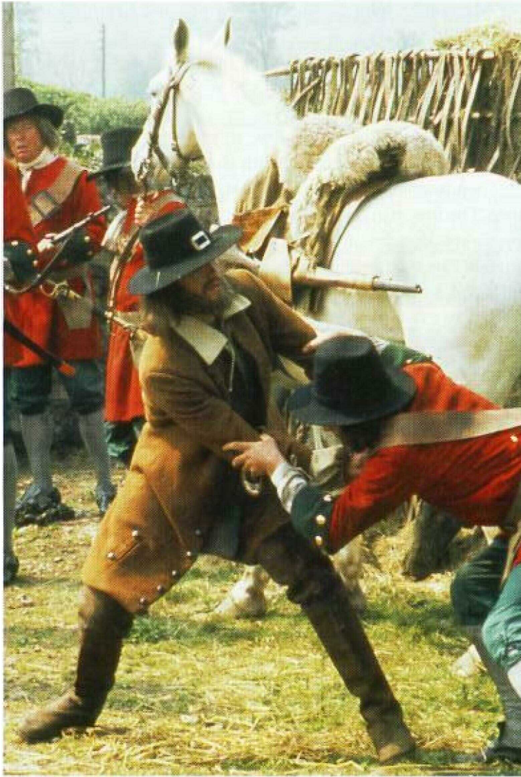
The first man put down his gun and ran at me.

The soldiers freed me, I climbed on my horse and I rode away behind Jeremy.