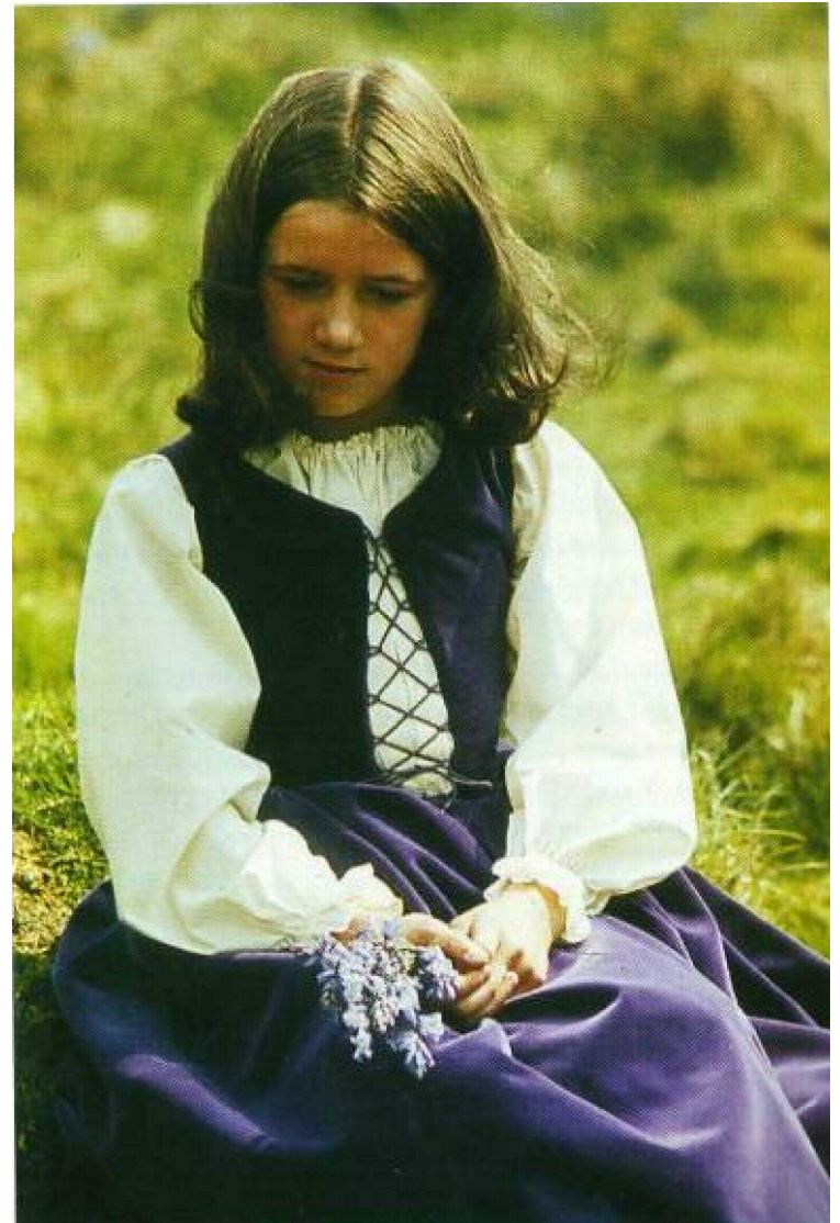
When I opened my eyes, I saw a little girl.