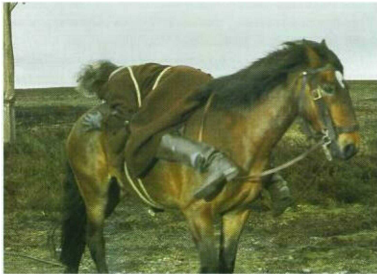
His feet were by the horse's neck and his head was near its tail.

In the evening, Farmer Snowe, the head man of the village, came to visit us with his three daughters. Uncle Reuben sat