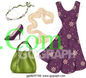
( bag - necklace)