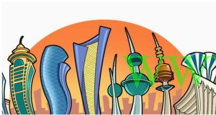
( shops - Kuwait City)