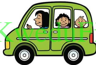
( mother - car)