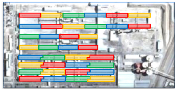
Figure 4– Pot Operations Scheme for next shift

The references for the figures is green for anode change, yellow for process control, red for metal tapping and blue for anode covering. This being the case, the scheme of procedure during the next 8 hour shift, would be like the one shown in Figure 4.