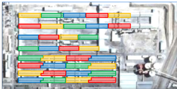
Figure 3 – Pot Operations Scheme

The same procedure is not performed in all pots at the same time, but different tasks are distributed in groups of pots (“operative phases”), thereby permitting our resources to be optimized. Figure3 shows how the procedures are programmed for a particular shift.