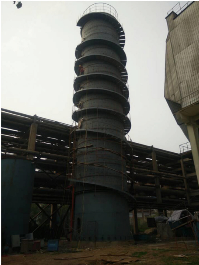
Figure 2 The patent heat-exchanger on site

The operation results are the temperature of hot water is 78-80 degree C and the temperature of exhaust gas is 65-68 degree C. The system can recover heat more than 450000 GJ/a and water 180000 t/a. Figure 2 is the patent direct heat-exchanger on site.