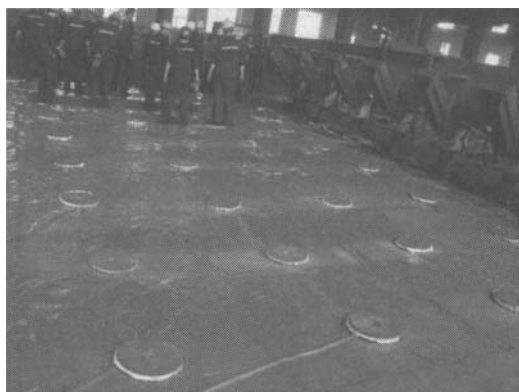
Figure 1 Green Pack Section that sealed with plastic sheet

First of all, it's very important that the baking furnace is properly maintained. All vertical gaps that are wider than 3mm between bricks and all spaces at joint locations such as the corners around the pits, flue wall and flue caps, flue wall and head wall, etc, should all be stuffed with refractory clay. Also, all flue cap covers in the C1, 1P, 2P, 3P and the 2 green pack sections should be closed tightly and sealed, Plastic sheet of 5mm thick is added on the top of the 1P, 2P and the two green pack sections for better sealing, which is shown in Figure 1.