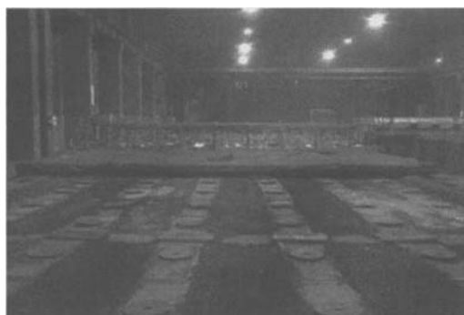
Figure 4 Refractory cover used in BF#2

The refractory covers are used on both fires of BF#2 (Figure 4).