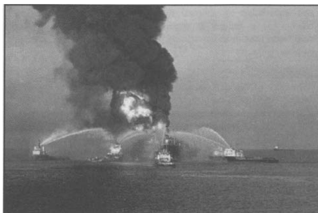
Photo 1 Deepwater Horizon Explosion in Gulf of Mexico on April 20, 2010. 11 deaths.

Both agencies investigated the accident; held public meetings and released transcripts of the meetings as well as preliminary reports on the causes of the accident. A final report was issued on April 29, 2010 by the US Department of Interior in junction with the USCG.