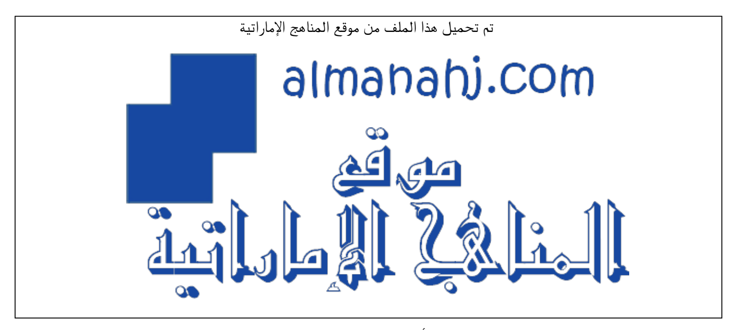
*للحصول على أوراق عمل لجميع الصفوف وجميع المواد اضغط هنا