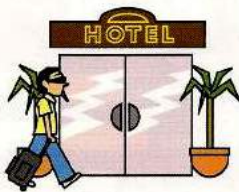
4 stay at a hotel