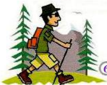
6 go hiking