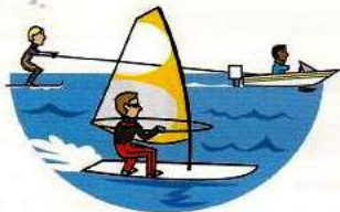
1 do water sports