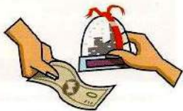
5 buy souvenirs