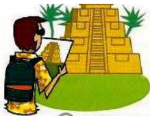
3 go sightseeing