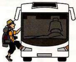
2 go on a trip