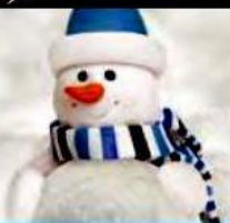
15th Annual Winter Games

B. Read again and complete the sentences.