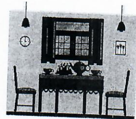
d ining room