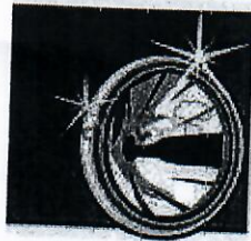
car l ight