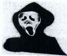
sc a ry