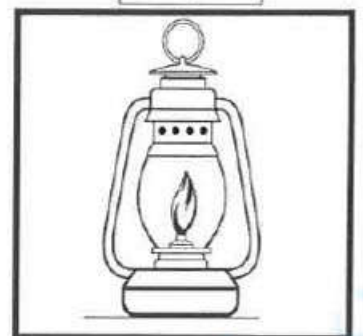
17) paraffin lamp