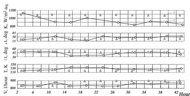
Fig.2 Changes in heating mode parameters to highly aluminate liquor at inhibitor concentrations: 1 - absence; 2 - 50 mg/l.

Some variation in the numerical values of the heat exchange coefficient in time associated with fluctuations in other variables, namely the performance of plant by the initial liquor (V, l/hours), the liquor temperature at the inlet to the heater (T, K), the difference between temperature of vapor and heated liquor ( \delta t , degree), the difference between temperature of heated liquor and the initial solution ( \Delta t , degree).