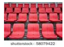
shutterstock · 58079422