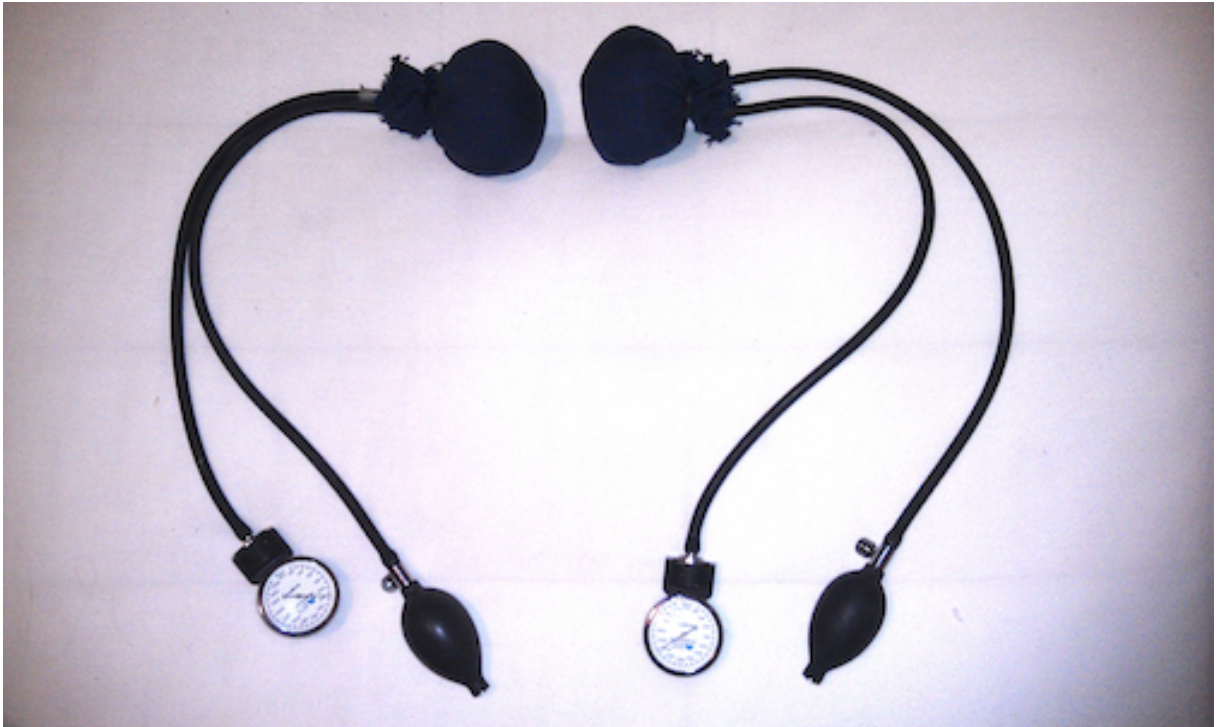
Image 2. The intervention device consisted of two modified sphygmomanometers with the inflatable bladders repurposed to expand within a spherical cotton sleeve (photo taken by the author using a digital camera)

The use of scripts for conveying information to subjects was intended to ensure consistency of delivery between sessions.