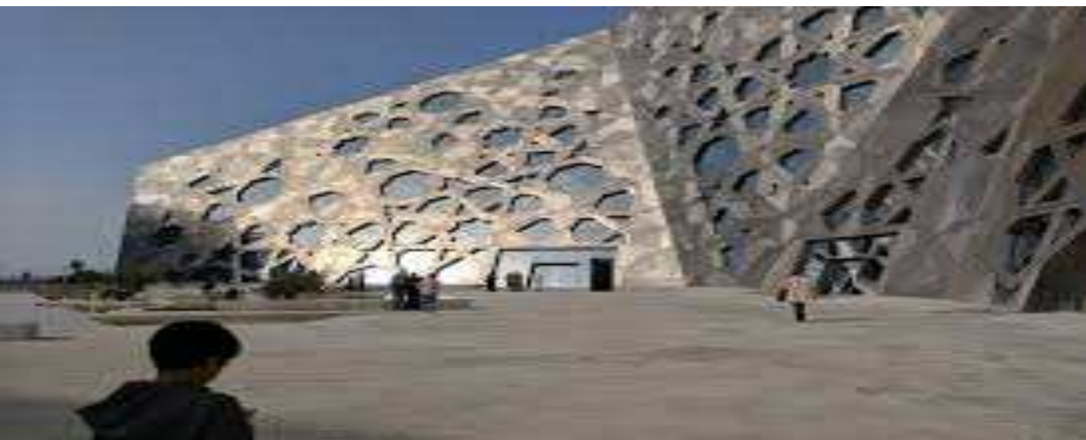
Jaber Al-Ahmad Cultural Centre