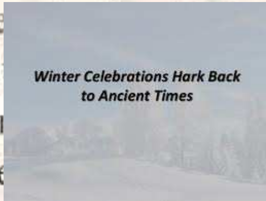
Winter Celebrations Hark Back to Ancient Times