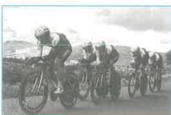
to ..... cycling.