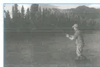
to ..... fishing.