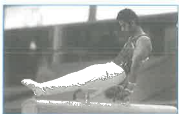
to ..... gymnastics.

4 Use PLAY, DO or GO To complete the phrases under the following pictures: