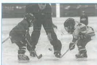
to ..... Hockey.