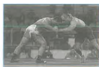
to ..... wrestling.