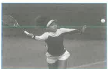
to ..... tennis.